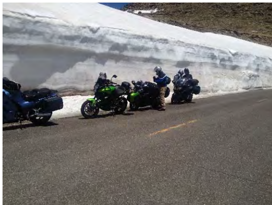
riders in the snow