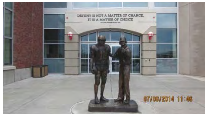
Sculptures in front of the stadium