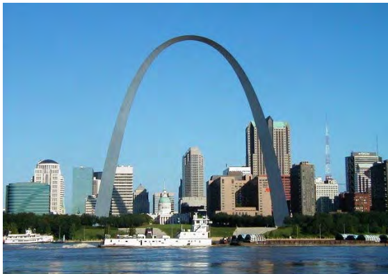
Gateway Arch St. Louis