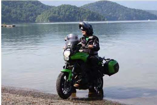
Cooling the tires after a hot ride!

Today we drove to South Lake Holston, Cherokee National Forest and the "Snake", a legendary road with a length of 33 miles (53 km) and 489 curves.