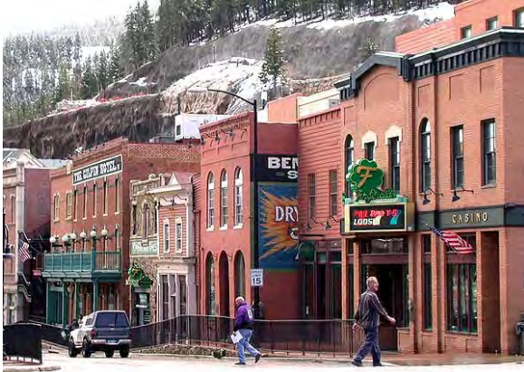
Houses in an old gold mining town

With Rick we drove the Peak to Peak Hwy over Russell Gulch, Coral Creek Canyon, Black Hawk City (old gold mining town with only 116 inhabitants, but 16 casinos) and Central City to the Langmont-Airport. There, Rick rented a small plane and took a flight with us. Then we went back to spend the night in Rick's house.