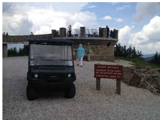
on the top of Mt. Mitchell