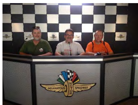
the champions are ...