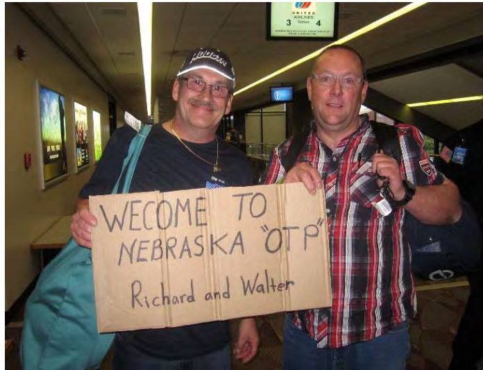
Arrival in Lincoln / Nebraska