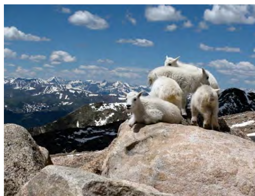
Isn't it great?!