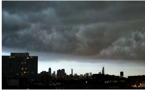
Chicago at 06/30/2014 afternoon

Arrived in Chicago, it first couldn't go on. Because of a monster storm (Derecho) all flights were cancelled.