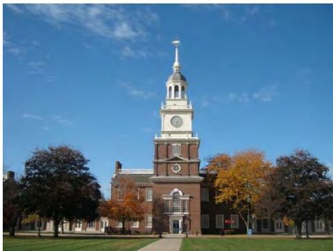
Entrance Henry Ford Museum