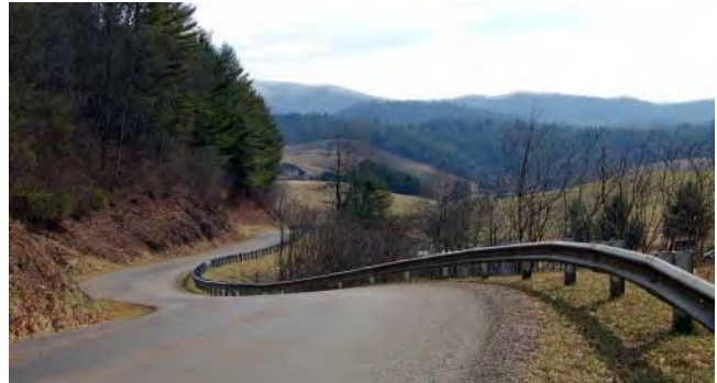
Part of the "Snake", length 33 , 489 curves

In the evening at the hotel there was a meeting of all previous OtP-Travelers. Here there was also the traditional OtP-eating with Hans-Ove (Surströmming = in brine pickled smelly fish. Furthermore, Chuck Kimball let shave his beard in a very funny performance. But for that it was to PAY! And then a ZL900 Eliminator was raffled off and of the proceeds we received 50% There were a lot of $$ for our travel budget. super power - thank you very much again for that.