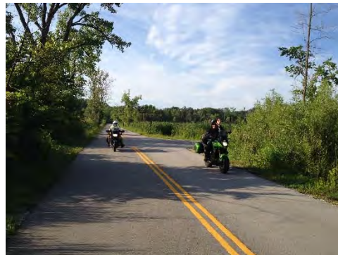
on the road again