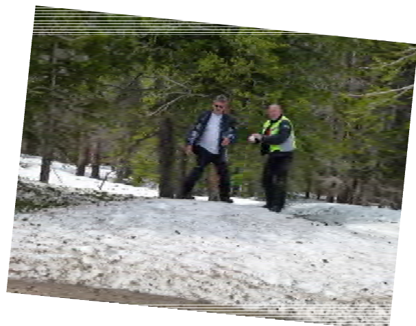
Playing children ☺