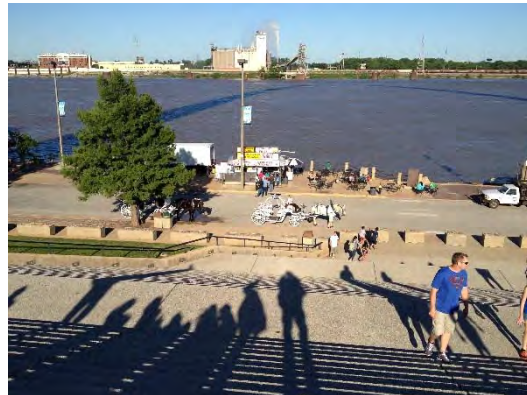
Shadow on the Mississippi