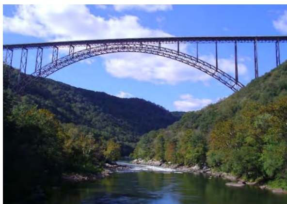
River Gorge Bridge