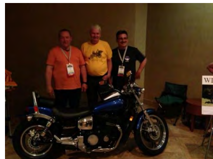
the raffled ZL900