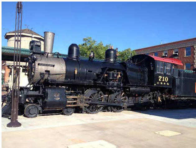
standing in the middle of Lincoln